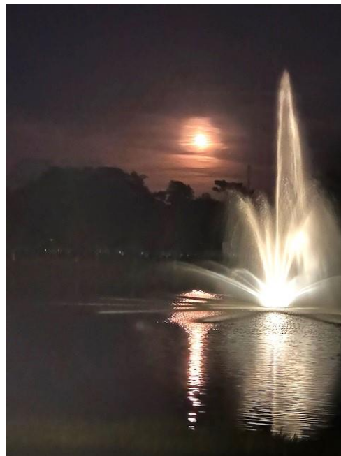
Beaver Moon over Pond by Anita Ford