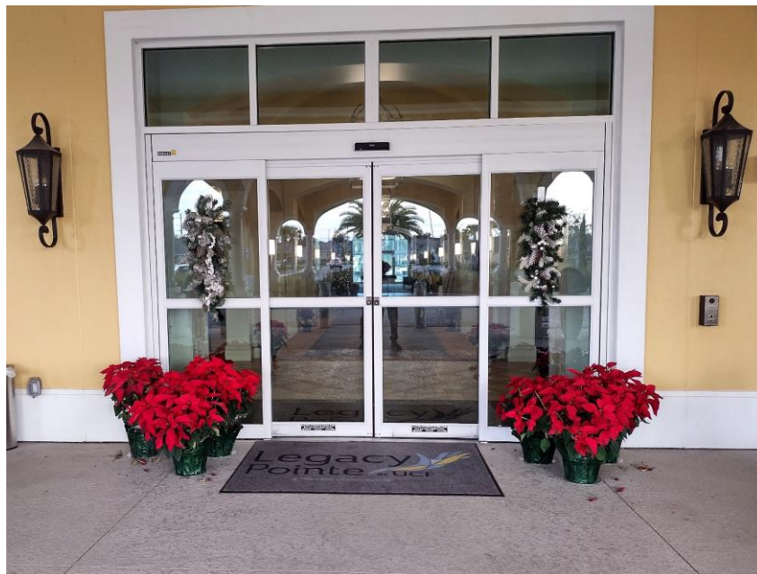
Our Front Entrance