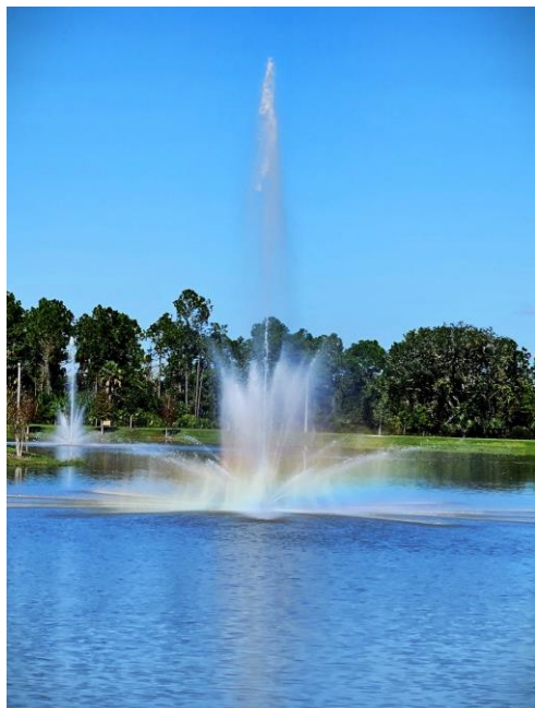
Rainbow on Pond by Polly del Vero