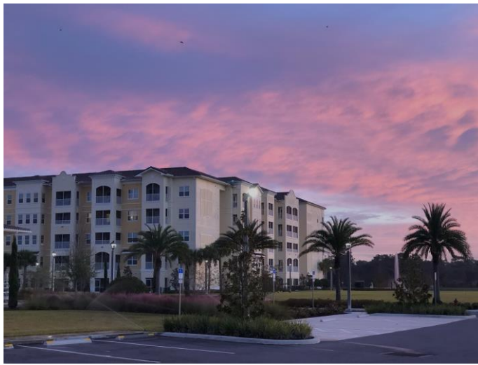
Sunrise Pic over LP Apartments